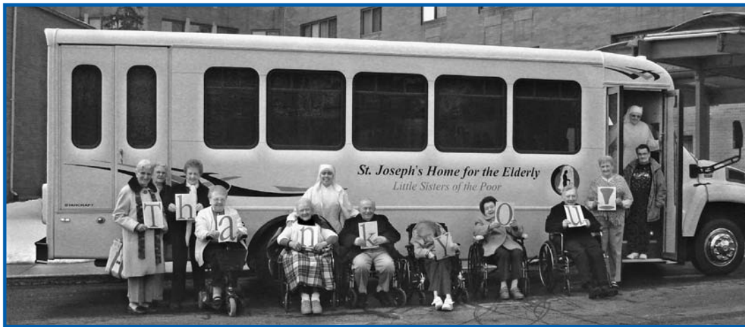
Residents and Little Sisters cheerfully show their gratitude for the new bus!

Despite the cold and stormy winter, Residents were warmed by the vision of the newly purchased 2009 Chevy Allstar XL Shuttle Bus parked at St. Joseph’s Home! This was made possible by funding from foundation grants, individual donors who supported the Beefsteak Dinner & 50/50 Raffle, the Basket Bonanza, 50/50 Raffle & Super Raffle, and donations from our Residents, their families and friends, and our employees and volunteers. We also experienced a tremendous outpouring of support from our good friends and benefactors who responded to the Match Gift campaign in our Winter issue of Blessings . The new bus offers comfortable seating for 24 passengers, a wheelchair lift and storage space. Our Residents have already enjoyed visits to nearby Homes operated by the Little Sisters of the Poor and eagerly anticipate picnic outings and shopping trips, spending time with friends at neighboring parishes, pumpkin-picking, vistas of the foliage in the fall, and special holiday excursions. Oh, there is so much to see and do! We can now bring new experiences to our Residents that will enrich their lives, giving them much to look forward to, and new memories to cherish!